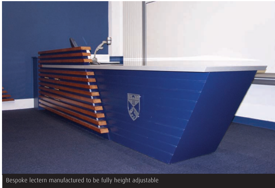
Bespoke lectern manufactured to be fully height adjustable