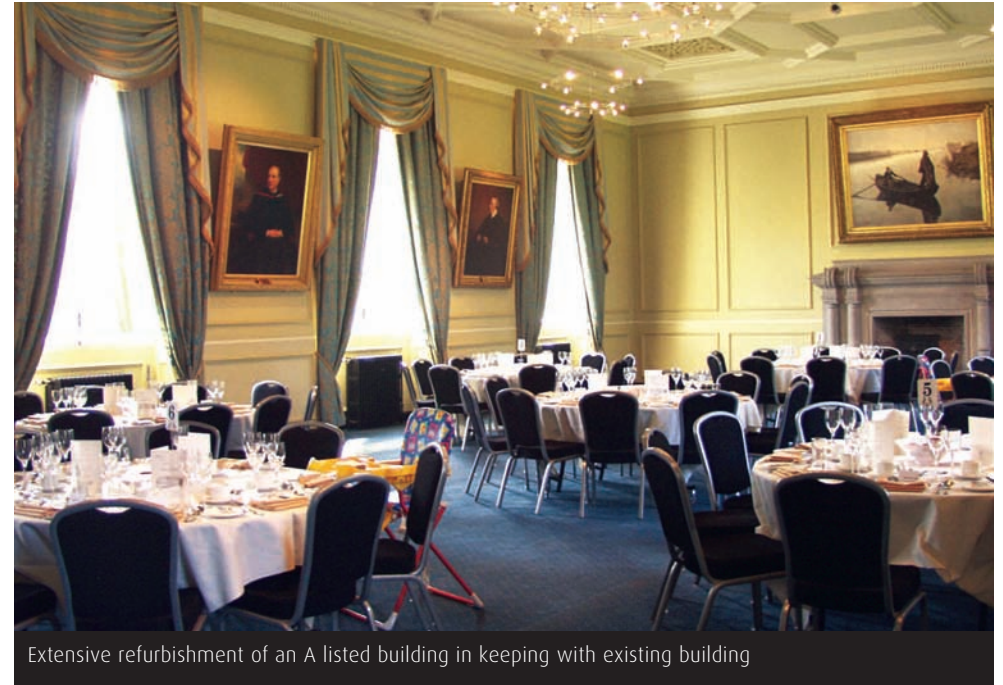
Extensive refurbishment of an A listed building in keeping with existing building