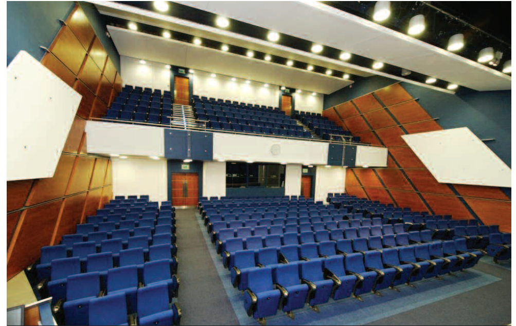
Complete refurbishment of lecture theatre with full AV system installed